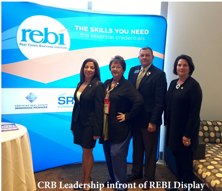
CRB Leadership in front of REBI Display